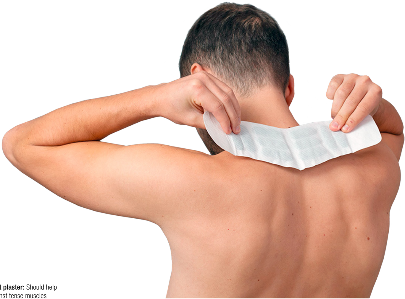
Heat plaster: Should help against tense muscles